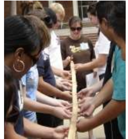
Any of the NIC staff members are happy to help schedule a program. Contact the office with questions.

As you begin your school year and identify issues that are not chapter-specific, but can best be addressed through communitywide programming, look to IMPACT.