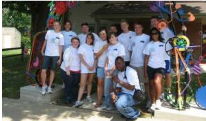
Students participating in UIFI's community service day, Into The Streets, at the Bloomington, Indiana Boys & Girls Club.

That strong response reinforces the benefits of UIFI, which offers student leaders the opportunity to explore, define, and enhance their leadership skills, personal awareness, commitment to their fraternity or sorority, and to grow to expect values-based action from themselves and those they lead. A five-day journey, with each day building upon the last, UIFI is